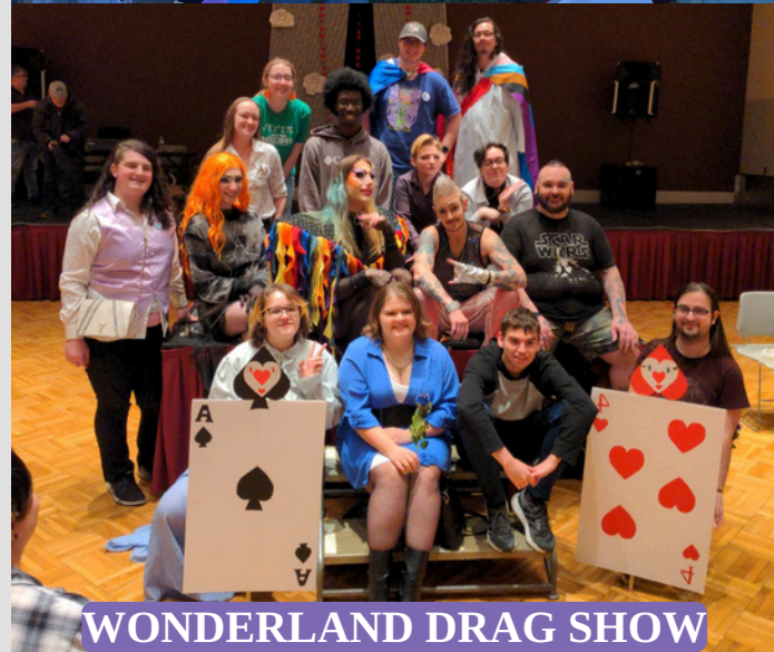
WONDERLAND DRAG SHOW