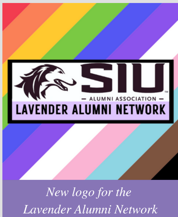
New logo for the Lavender Alumni Network

A QUARTERLY NEWSLETTER FOR LESBIAN, GAY, BISEXUAL, TRANS, AND QUEER ALUMNI OF SOUTHERN ILLINOIS UNIVERSITY